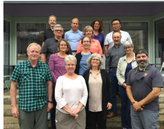
NPS WSR Steering Committee

Portions of the meeting were spent in the field—visiting the Ten Mile River Access point to discuss river access issues associated with sedimentation and channel migration, and visiting the historic Milanville-Skinner Falls Bridge to discuss the cultural significance and repair needs of the bridge. A special thanks goes out to Two Sisters Emporium for their delicious food and friendly meeting accommodations.