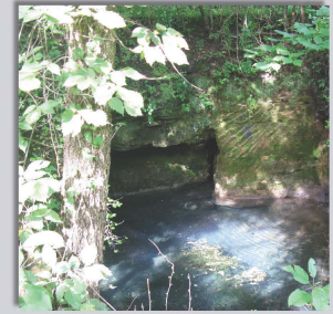
GROTTO / POOL